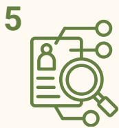
Onboarding and screening