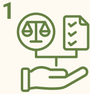
In-house legal and compliance teams