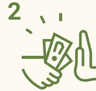
Anti-bribery and anti-corruption manual