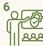
Regular training and education

* As part of our ongoing commitment to maintaining the highest standards of compliance, we are continuously reviewing and updating our policies and resources to ensure they remain up-to-date. Should you have any questions or require more information regarding our compliance policies, please contact us at nm_kyc@nunchimarine.com